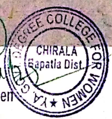
Principal Y.A. Govt. Degree College for Women CHIRALA, Bapatla., (A.P.)