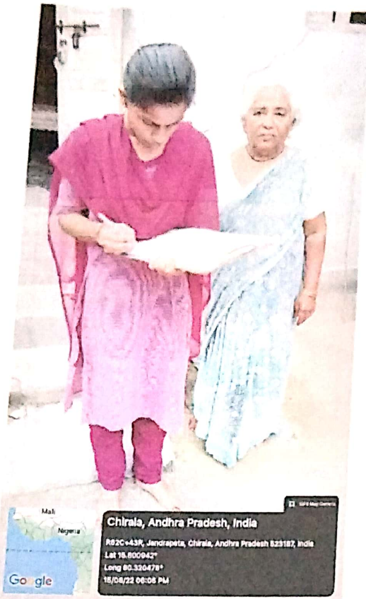
Chirala, Andhra Pradesh, India R92C+43F, Jendrapeta, Chirala, Andhra Pradesh 523187, India Lat 16.800942° Long 80.330478° 18/04/22 06:06 PM