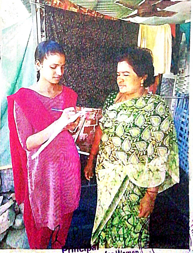
Principal Y.A. Govt. Degree College for Women CHIRALA, Bapatla., (A.P.)